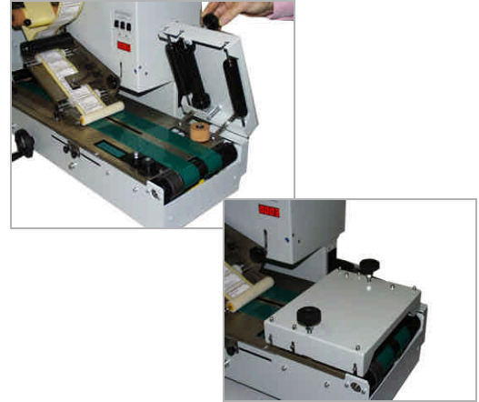
Optional Flap Folder. Folds & seals the flaps of paper