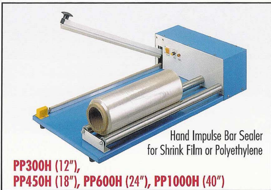
PP300H (12"), PP450H (18"), PP600H (24"), PP1000H (40")