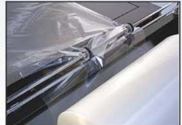
Pin Wheel Hole Punch

The operator places the product on the package loading tray in between the two layers of centerfold film. The operator then moves the package into the sealing area and lowers the hood. Once the hood is lowered, the Dual Magnets apply pressure to make the seal. Once the seal is made, the Automatic Magnetic Hold Down keeps the hooded chamber down until the film has shrunk. When the shrink time is completed, the hood will automatically return to the up position and the operator may remove the completed package. Complete cycle time is approximately 5-10 seconds.