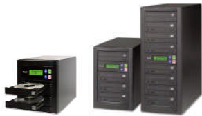
TEAC CD & DVD Duplicators

TEAC manufactures a complete line of CDR and DVDR Duplicators, AutoLoaders and AutoPublishers.