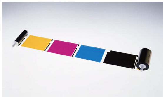
TEAC's Photo and Color ribbons include a separate black panel